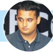
Smith Gonsalves National Cyber Defence Research Centre

How are attackers intruding into your system?